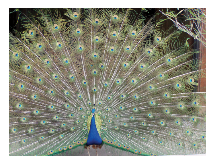
Fig. 1. Peacock plumage as an example of biological pattern forma tion. The complex pattern is produced by a combination of the arrangement of feathers, differential regulation of feather length, shapes of the feather vane, texture of the feather barbs (producing optical interference patterns), and the differentiation of neural crest cells. Indian Blue Peacock (Pavo cristatus) in Los Angles Arboretum in March, 2008.

Another key, but often neglected, component of patterning mechanisms is the control of timing. The temporal order of gene expression may have profound influences on patterning, as is known for the temporal colinearity of Hox genes, for example (Duboule, 1994; and interview of Duboule in Richardson, 2009b). In evolution, timing differences in patterning systems (heterochrony) may underlie phenotypic differences, as may be the case with beak shape in Darwin's finches (see Abzhanov et al. , 2004; Wu et al. , 2004; and interview of Cliff Tabin in Richardson, 2009c). The study of Hox gene organization at the genomic level provides novel information about the regulation of clustered developmental