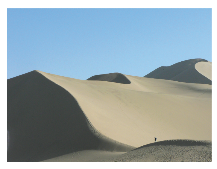
Fig. 2. Sand dune as an example of pattern formation in non-living systems. The property of sand grains, the wind and gravity work together to produce periodicity in sand ripples and sand dunes. See also Hazen (this issue). Sand dunes along the silk road, Dunhuang, China.

The sudden appearance of diverse animal body plans is vividly illustrated by fossils unearthed from Chengjiang Biota in Yunan, Chian, and which have their origin in the Cambrian period, 530 million years ago (Chen, 2009). It is particularly interesting to consider how these ancient animal body plans arise in the context of both Newman's "dynamical patterning modules" (Newman and Bhat, 2009), and Davidson's "gene regulatory networks" (Peters and Davidson, 2009). While the evolution of body plans and